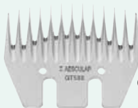
GT588 13 teeth 3.5 mm