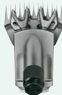
GT369 shearing head alone, with upper plate GT578 lower plate GT588, can also be connected to cattle clipping machine.