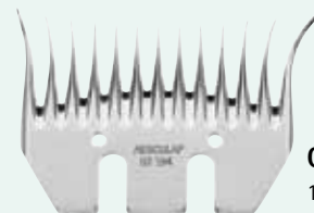
GT594 13 teeth 3.5 mm